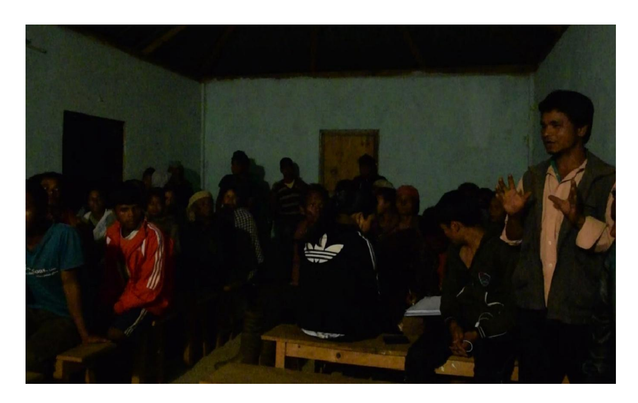
Picture 4: Showing the Focus Group Discussion held in Lakasein Village