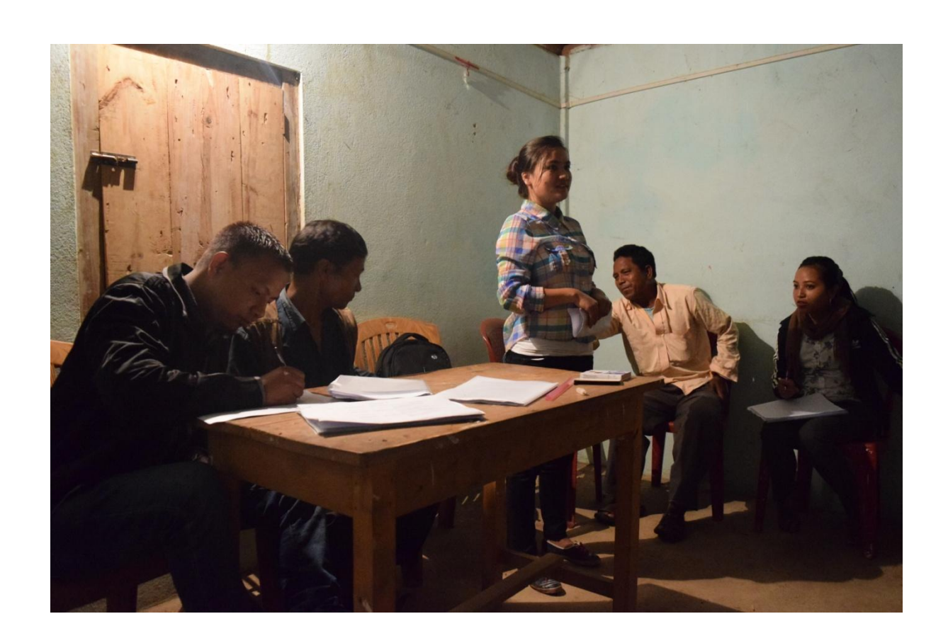
Picture 3: Showing the Focus Group Discussion held in Lakasein Village