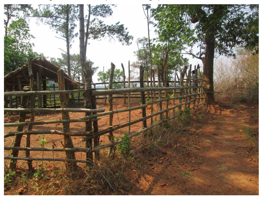
Picture 1 and 2: Showing the land to be acquired for setting up of the Facilitation Centre.