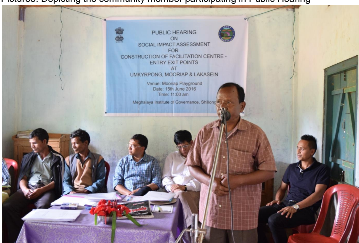
Picture5: Depicting the community member participating in Public Hearing